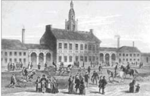
1776 Engraving of Independence Hall

Independence Hall and the Liberty Bell, two of America's most revered symbols of freedom, date back to the British rule of the American colonies. The main structure of Independence Hall was completed in 1732, and the final casting of the Liberty Bell was completed