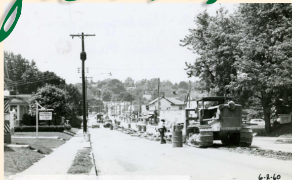
The 700 block of Bethlehem Pike in Erdenheim underwent construction in 1960. This photo, looking south on the pike, was taken by Aubrey Williams and is in the Springfield Township Historical Society archives

A car went up the front steps of a house on Bethlehem Pike near the intersection of Gordon Rd. in Erdenheim between 1935 and 1940. The Old Wheel Pump Restaurant, a longtime neighborhood restaurant, was the site of "Floor Show & Orchestra Niteley," a sign says. This photo by Roger Wells is in the Springfield Township Historical Society archives.