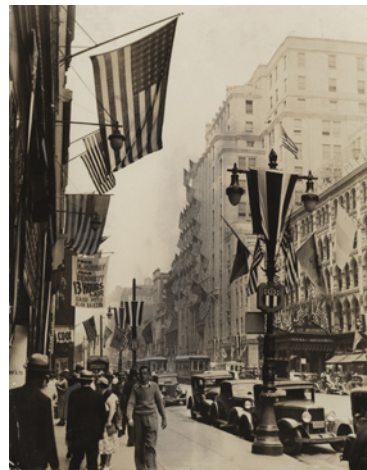
Eighth and Market Streets in 1936